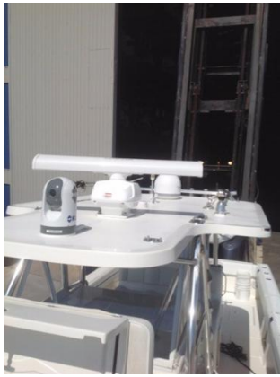
Key West Style Hard Top