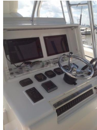
Electronics and Navigation