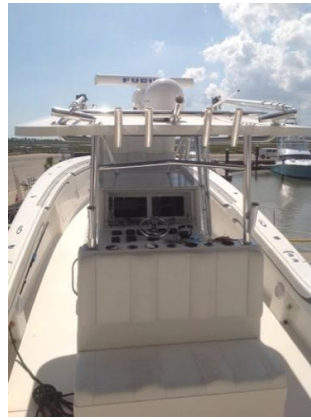
Aft Mezzanine Seating with Cooler