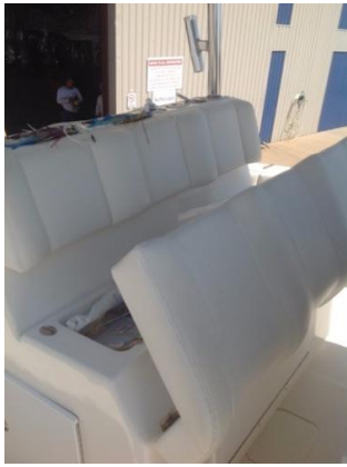
Leaning Post with Storage