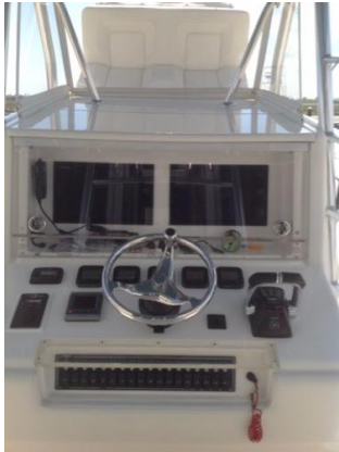
Electronics and Navigation