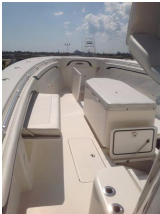
Forward Foldout Seating and Coffin Box