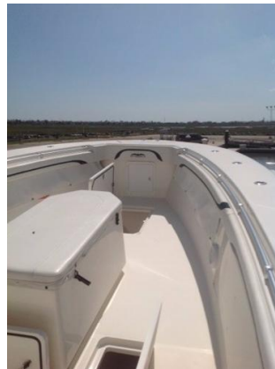
Coffin Box and Forward Storage

Evolution By MacGregor Yachts Evolution by MacGregor Yachts LLC, 2352 PGA Blvd., Palm Beach Gardens FL Toll-free: 888-314-5505 Tel: 561-799-9505 evolution@macgregoryachts.com http://www.evolutionbymacgregoryachts.com/