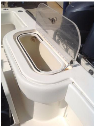
Aft Live Well