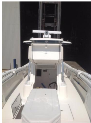
Coffin Box and Forward Console Door