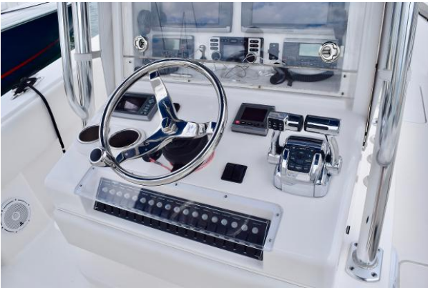
Electronics and Navigation