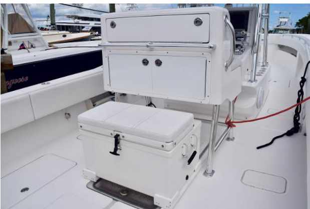
Leaning Post Tackle Storage