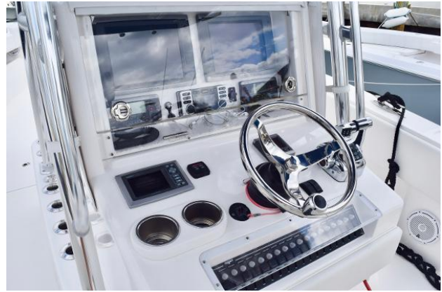
Electronics and Navigation